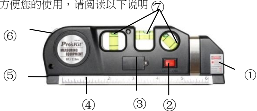
①激光投射镜头②开关③电池仓④直尺⑤钢卷尺⑥卷尺按钮 ⑦水平泡 使用安全

非常感谢您购买 Pro'skit PD-161-C 多功能激光水平打线器。在操作 PD-161-C 之前，请阅读本手册。请将本手册存放在安全、方便取用的地方，以备将来参考。这是一款多功能的家用工具，集合了卷尺，水平尺，直尺和激光投线的功能，为方便您的使用，请阅读以下说明。